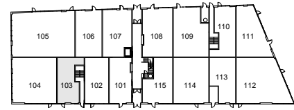
Ground Floor Key Plan