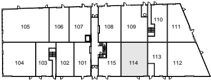
Ground Floor Key Plan